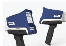
Handheld XRF(PMI) Model: Vanta Brand: Olympus (Evident) Country of Origin: USA