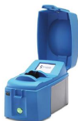
Viscosity Meter Model: Q3000 Brand: Ametek-Spectro Scientific Country of Origin: USA