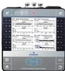
Machinery Health Analyzer/ Vibration Analyzer Model: CSI2140 Brand: Emerson Country of Origin: USA