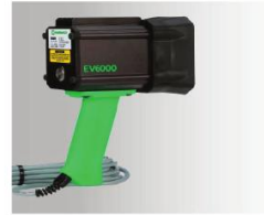
Ultra Violet Light (UV Light) Model: EV6000 Brand: Magnaflux Country of Origin: USA