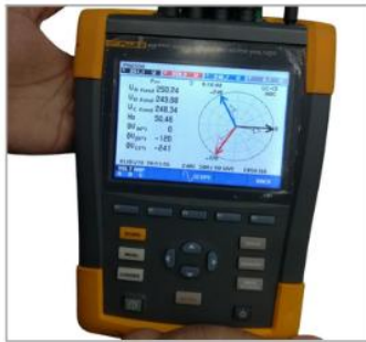
FLUKE 438-II Energy & Motor Analyzer