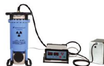
Radiography X-Ray Generator Model: XXG-2005 Brand: ZHONG YI NDT CO.LTD Country: