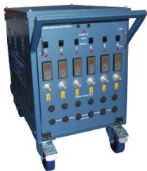
Post Weld Heat Treatment Model: AH4712-EOA Brand: Globe PWHT Country of Origin: UK