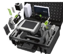
Laser Shaft Alignment Model: AT-200 Brand: ACOEM Country of Origin: Sweden