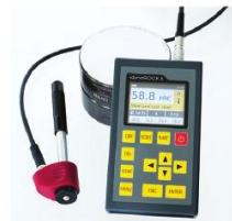
Hardness Tester Model: dynaROCK II Brand: BAQ GmbH Country of Origin: Germany