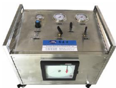
Hydraulic Pressure Test Model: WY-70J-J0 Brand: WINGOIL Country of Origin: China