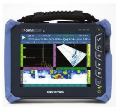
Phased Array Ultrasonic Flaw Detector Model: Omni Scan SX Version: 16:64 Brand: Olympus (Evident) Country of Origin: USA