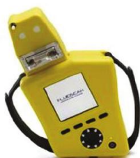
Fluid Scan Model: Q1000 Brand: Ametek-Spectro Scientific Country of Origin: USA