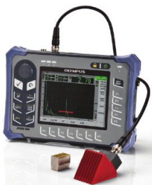
Ultrasonic Flaw Detector Model: Epoch 600 Brand: Olympus (Evident) Country of Origin: USA