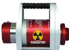
Radiography Gamma Projector Model: Dual 120 Brand: Gammatech Country of Origin: South Africa