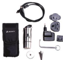
Laser Shaft Alignment Model: AT-200 Brand: ACOEM Country of Origin: Sweden