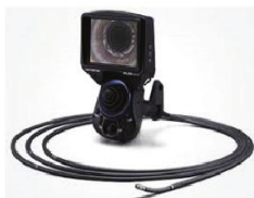
Industrial Video Borescope Model: iplex Ultra Lite Brand: Olympus (Evident) Country of Origin: Japan