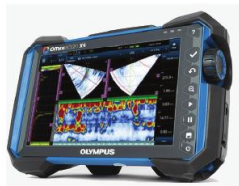
Phased Array Ultrasonic Flaw Detector Model: OMNISCAN X3 Version: 32: 128 Brand: Olympus (Evident) Country of Origin: CANADA