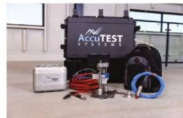
Safety Valve Test Model: AccuTEST-SL Brand: AccuTEST System Country of Origin: Holland