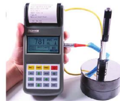
Hardness Tester Model: MH310 Brand: Mitech Country of Origin: China