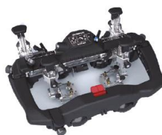
AxSEAM Semiautomated Scanner Brand: Olympus (Evident) Country of Origin: CANADA