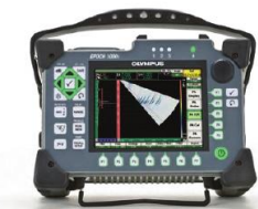
Ultrasonic Flaw Detector (PA) Model: Epoch 1000i Brand: Olympus (Evident) Country of Origin: USA