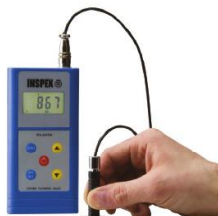
Coating Thickness Gauge Model: IPX-201FN Brand: Bowers Metrology Country of Origin: China