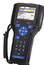
Field/HART Communicator Model: 475 Brand: Emerson Country of Origin: USA