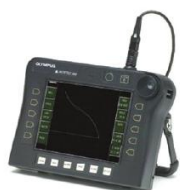
Eddy Current Flaw Detector Model: Nortec 500S Brand: Olympus (Evident) Country of Origin: USA