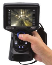
Industrial Video Borescope Model: iplex G Lite Brand: Olympus (Evident) Country of Origin: Japan